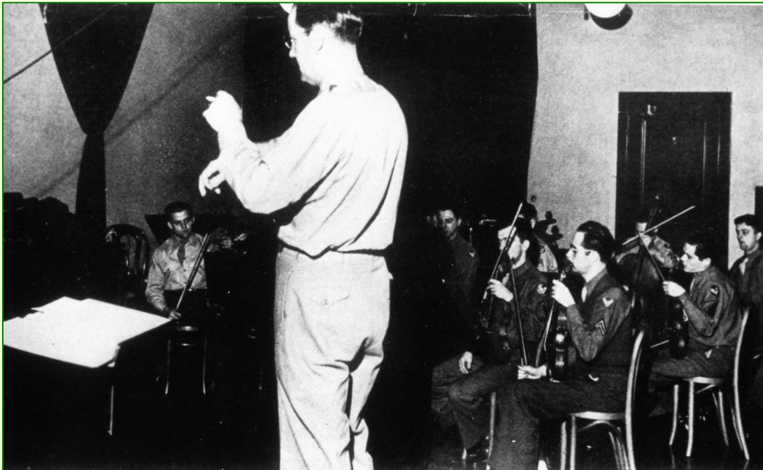
Capt. Glenn Miller and the Army Air Forces Training Command Orchestra V-Disc Recording Session, RCA Studios, New York October 29, 1943