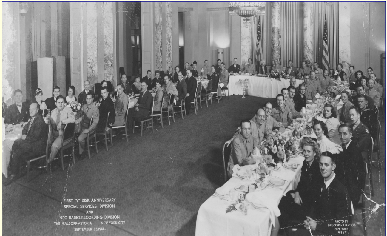
V-Disc First Anniversary Dinner, September 25, 1944 Waldorf-Astoria Hotel, New York