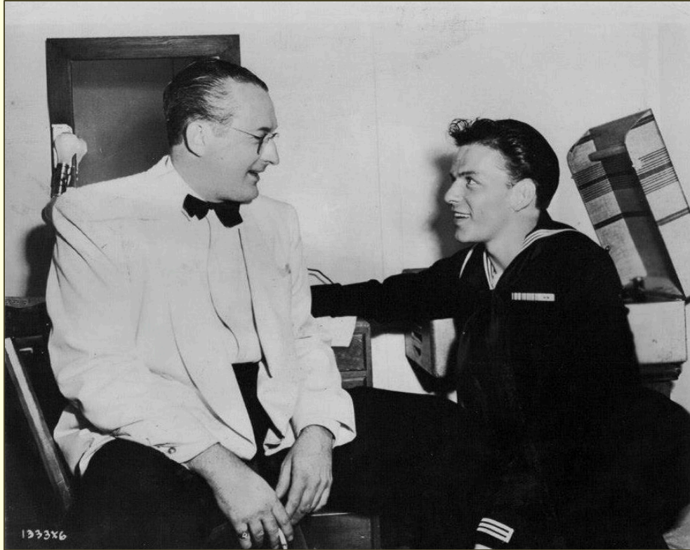
Tommy Dorsey and Frank Sinatra at M-G-M, August-November 1944 During filming of "Thrill of a Romance" (TD) and "Anchors Aweigh" (The Voice)