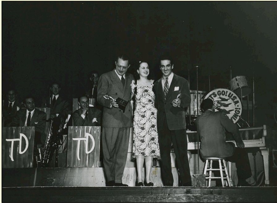
TD and Gene Krupa Onstage, Paramount Theatre, December 1943