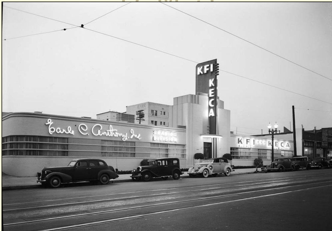
KFI and KECA, Los Angeles