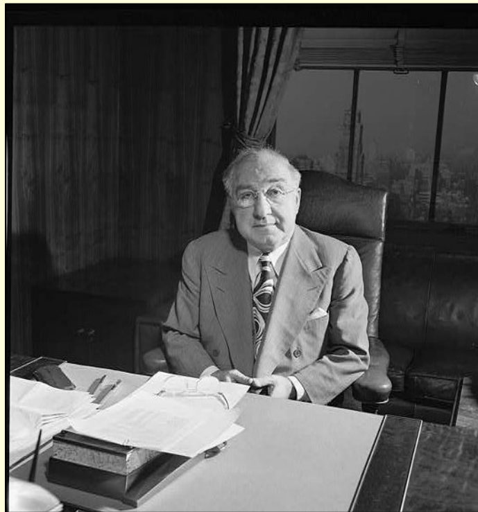
James Cesar Petrillo American Federation of Musicians

"New York, Nov. 13 - It's all over brother, including the shouting! Yep, on Armistice Day, November 11, somewhere around 6 pm after five hours of clearing legal throats, bantering words back and forth, Mr. James C. Petrillo, president of the American Federation of Musicians, sat back in his leather chair, victor in a heated and spirited contest that ran some 28 months. And you can believe it, that this armistice marks the end of hostilities that were as bitter and hard fought as World War I. Skimming over the contracts that RCA-Victor, on behalf of its recording corporation, and Columbia Recording Corporation signed, two additional clauses were noted as having been inserted into the contract that Decca and some 100 additional companies signed in September 1943. These additional clauses have plenty of bite in them and setup a system whereby the AFM "protects" itself in case the whole thing should happen again after the present contract (one that was just signed expires on December 31, 1947. Harry James will be the first to disk for Columbia, cutting two sides today (13) a 11 am Vaughn Monroe was the first RCA-Victor band to disk, cutting four sides yesterday ... Tommy Dorsey is set to record the first week on the coast" 67