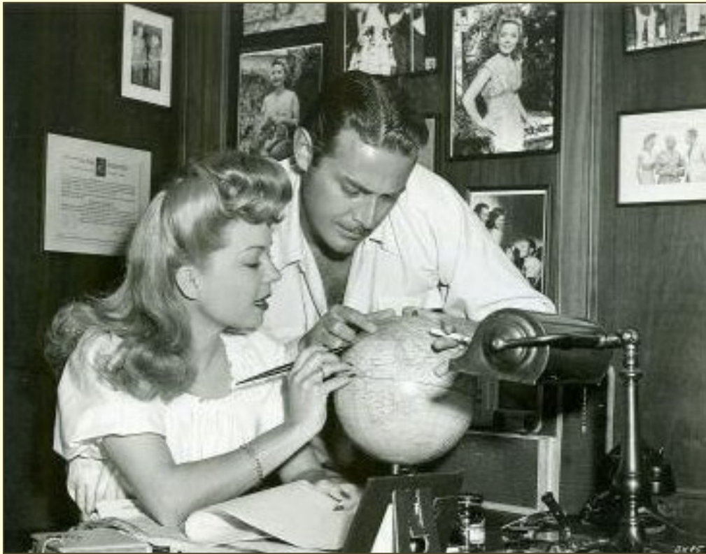
D M S Jon Hall and Frances Langford