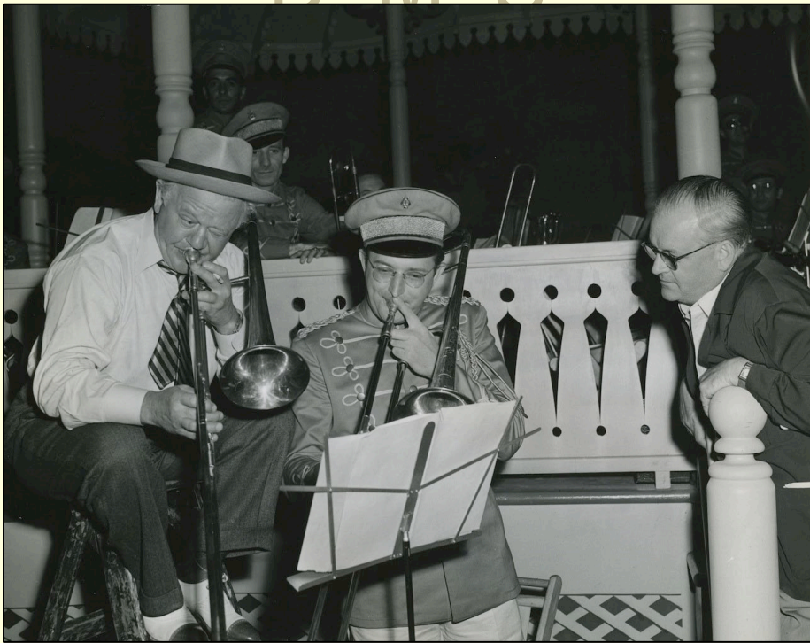
At M-G-M with Charles Winninger, "Broadway Rhythm"