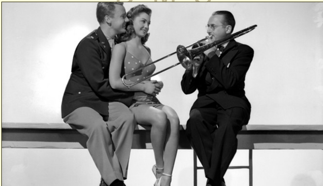
"Thrill of a Romance" August-November 1944 Van Johnson, Esther Williams, Tommy Dorsey