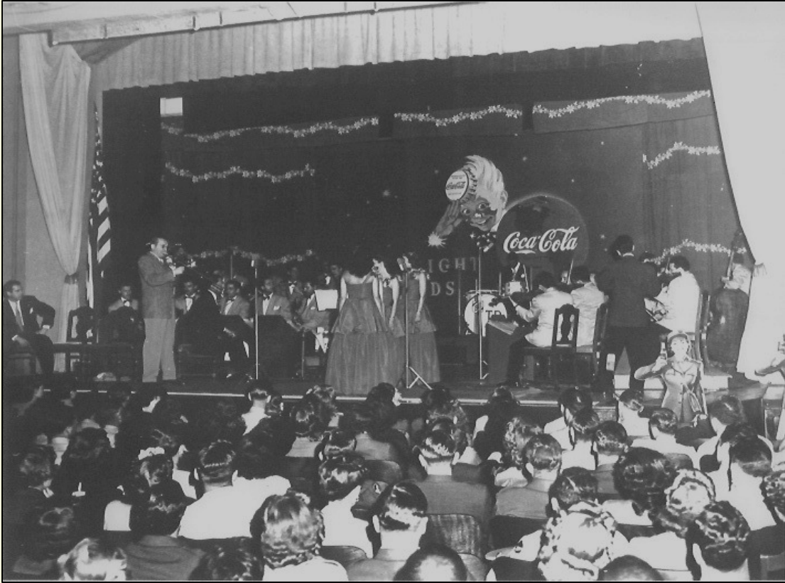
D M S Spotlight Bands Broadcast