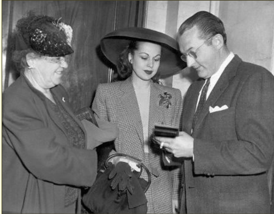
Tommy Dorsey with his mother and wife Pat Dane "Taking the Fifth"