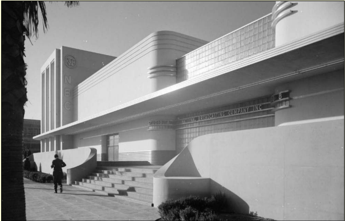
NBC Radio City Hollywood