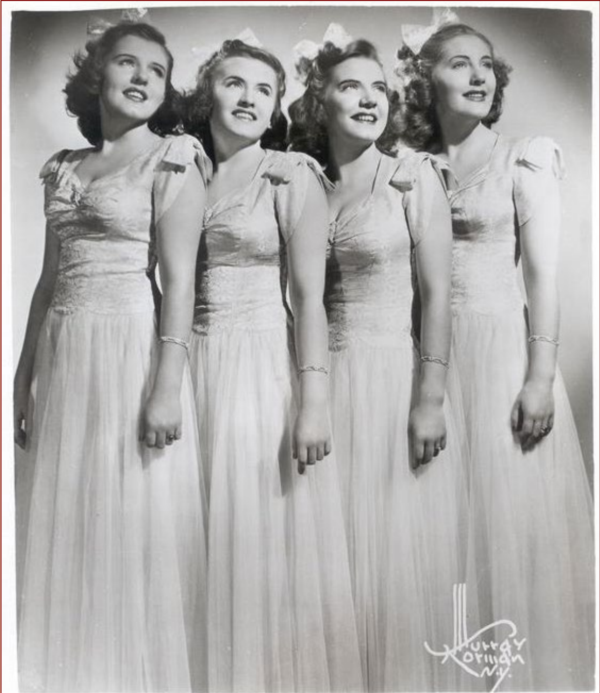
THE SENTIMENTALISTS Featured with TOMMY DORSEY And His Orchestra