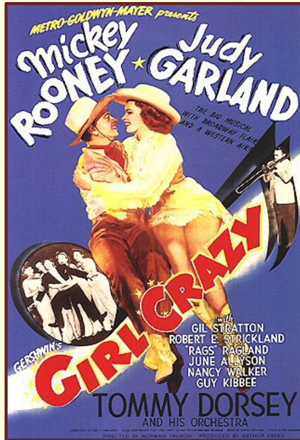
"Girl Crazy" Premiered November 26, 1943