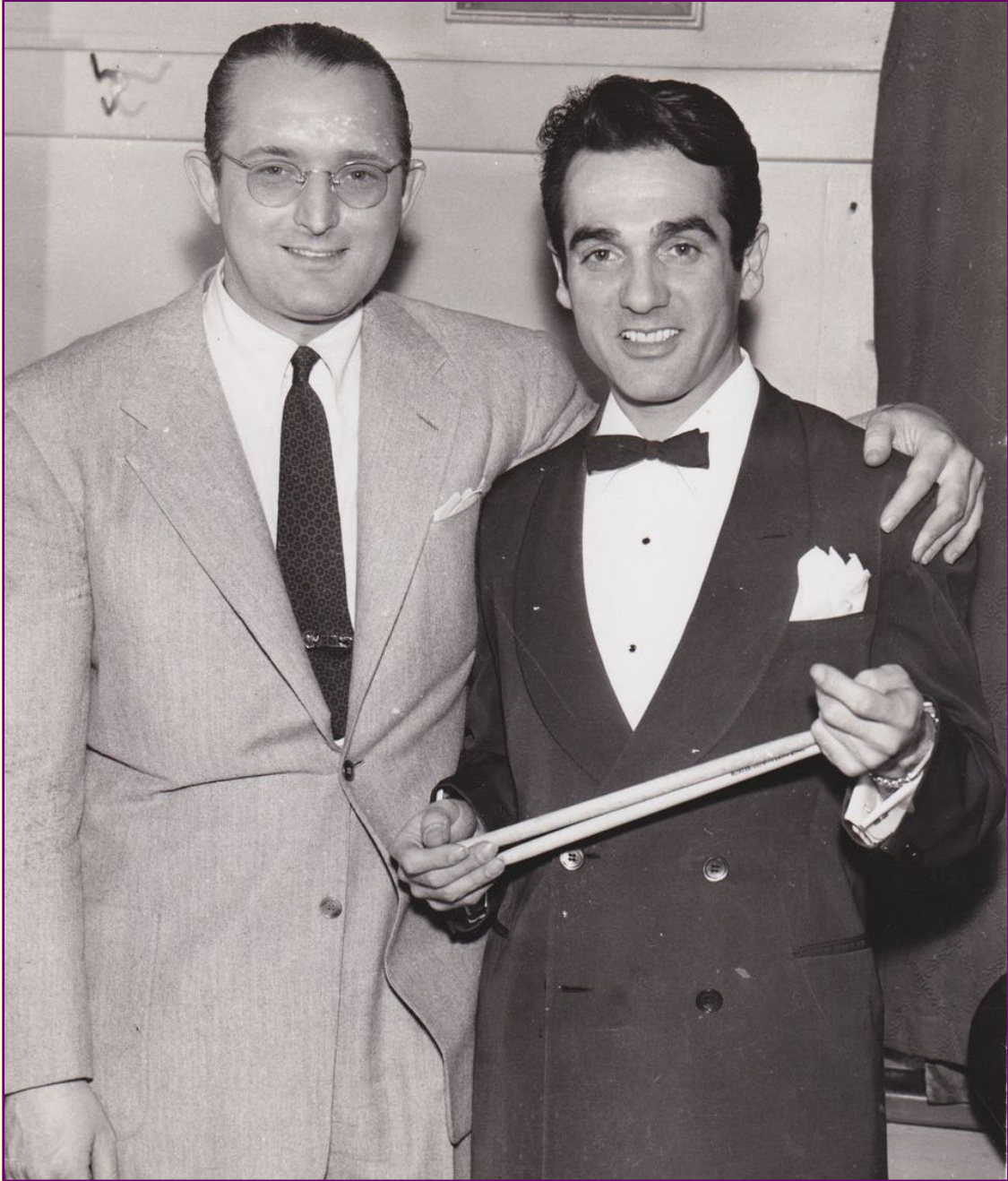
TD welcomes Gene Krupa December 22, 1943