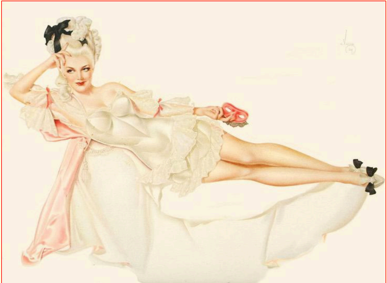
“DuBarry Was A Lady” Artwork Created For M-G-M by Alberto Vargas Used With Summer 1943 Trade Advertising