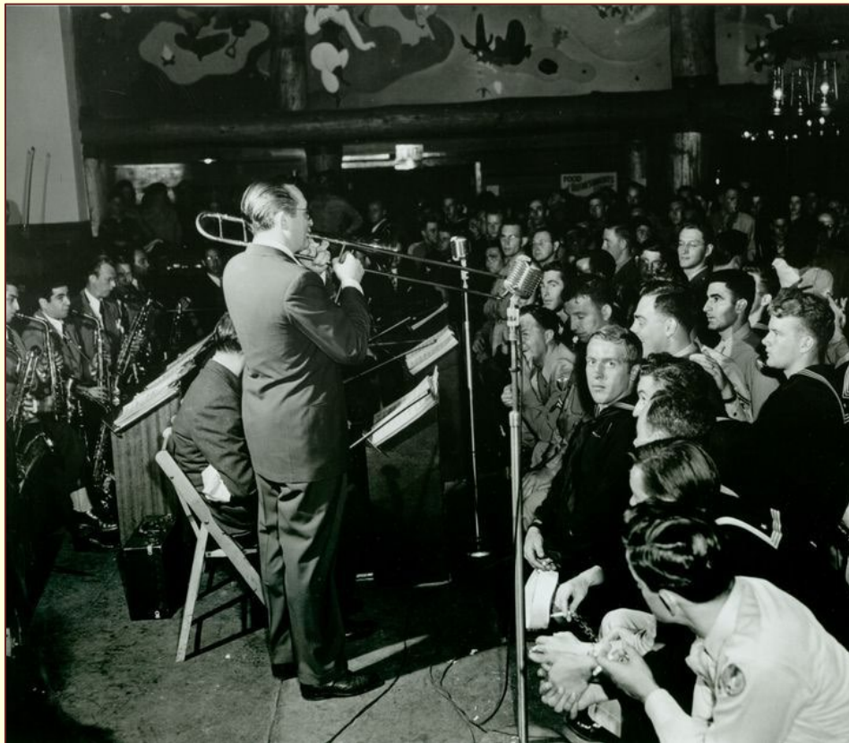
TD Appears at the Hollywood Canteen