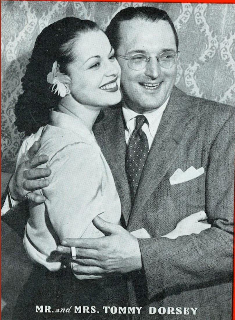
MR. and MRS. TOMMY DORSEY