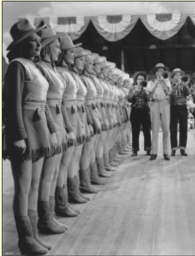
January 12, 1943 (Tue) M-G-M "Girl Crazy" Production Stills