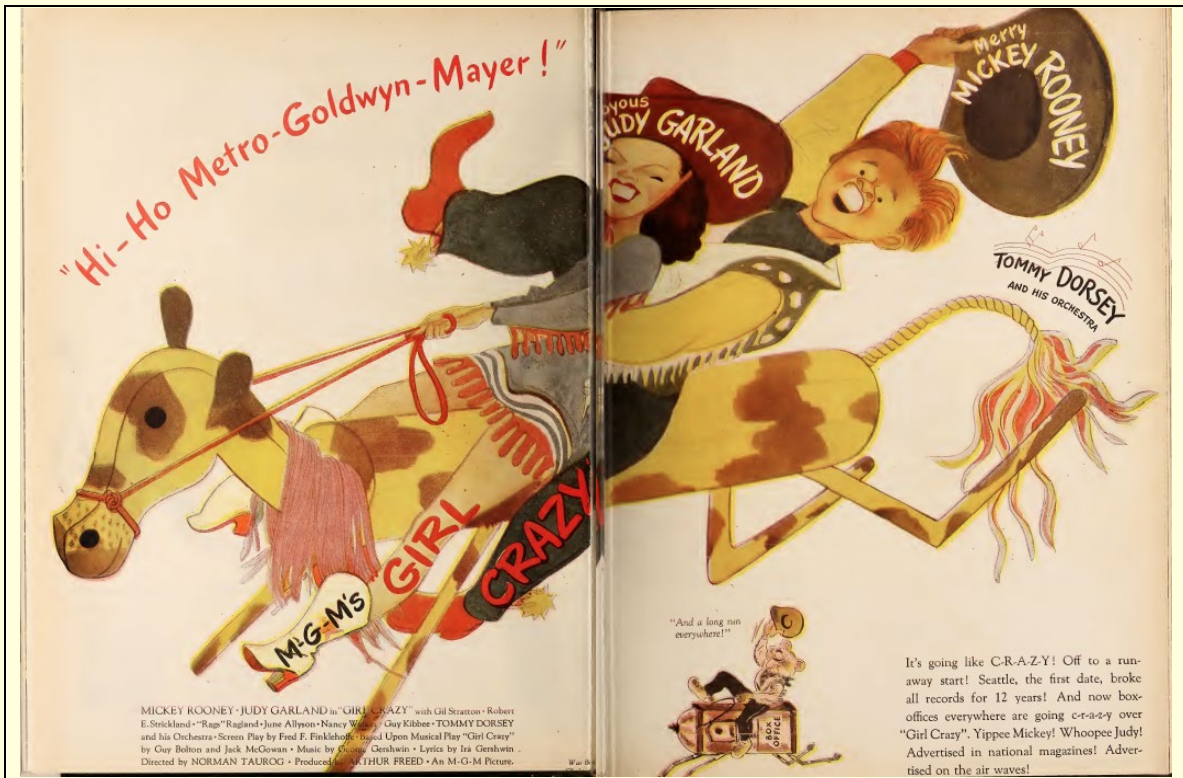
D M S Double Page Trade Press Spread for "Girl Crazy" December 1, 1943