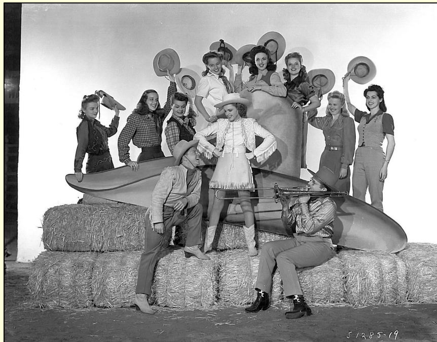
M-G-M "Girl Crazy" Production Stills