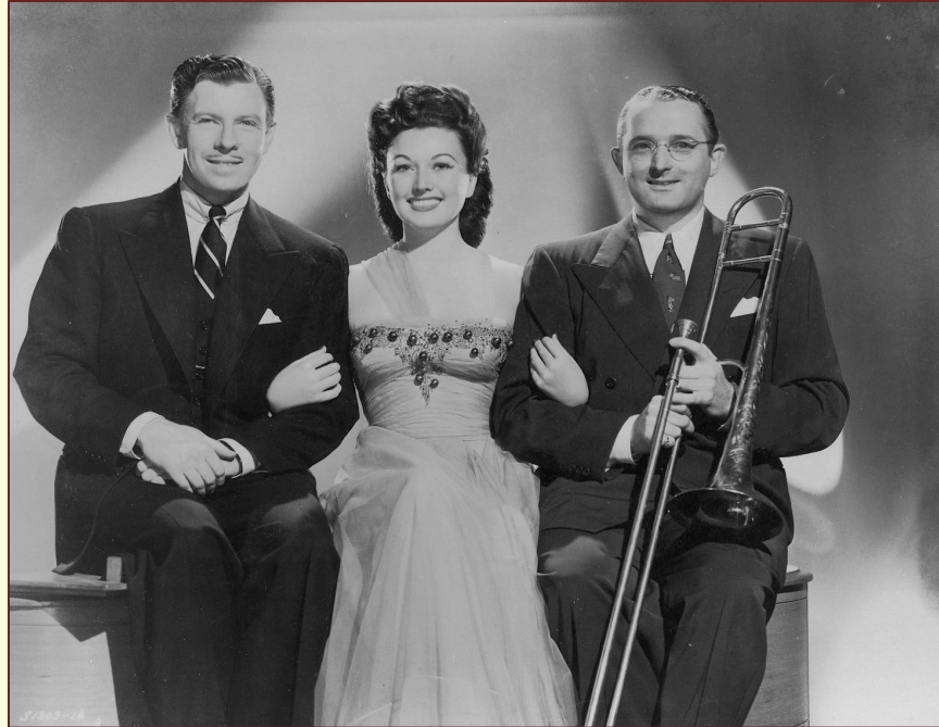
George Murphy, Ginny Simms and Tommy Dorsey "Broadway Rhythm"