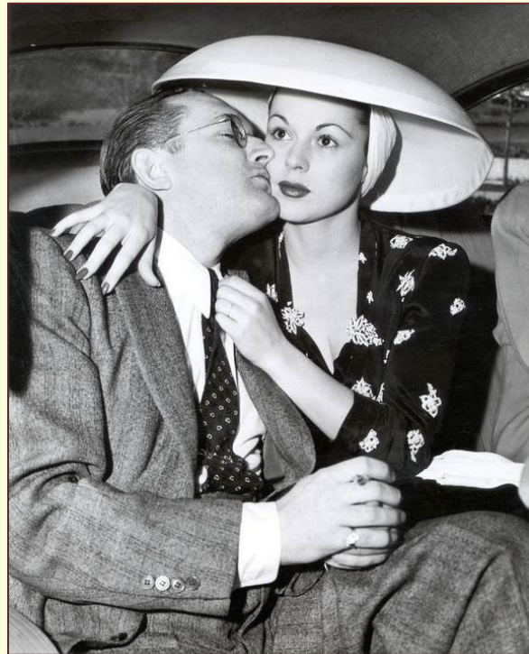
Mr. and Mrs. Thomas Francis Dorsey, Jr. Las Vegas, Nevada April 8, 1943