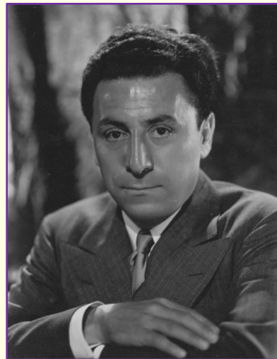
Jack Perlman (Jack Pearl) "Baron Munchausen" "Vas You Der, Sharley?"