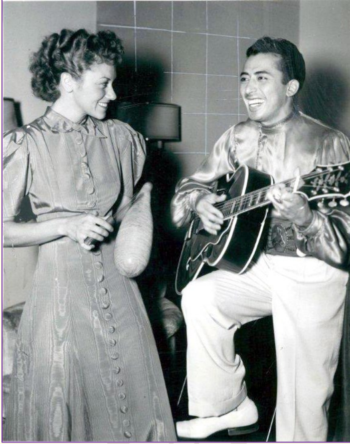
September 6, 1936, Dallas, Texas