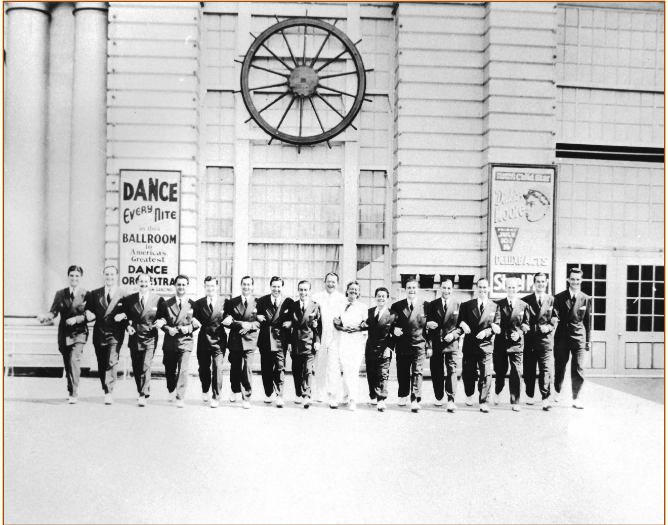
Tommy Dorsey and his Orchestra Steel Pier, Atlantic City, New Jersey July 1936