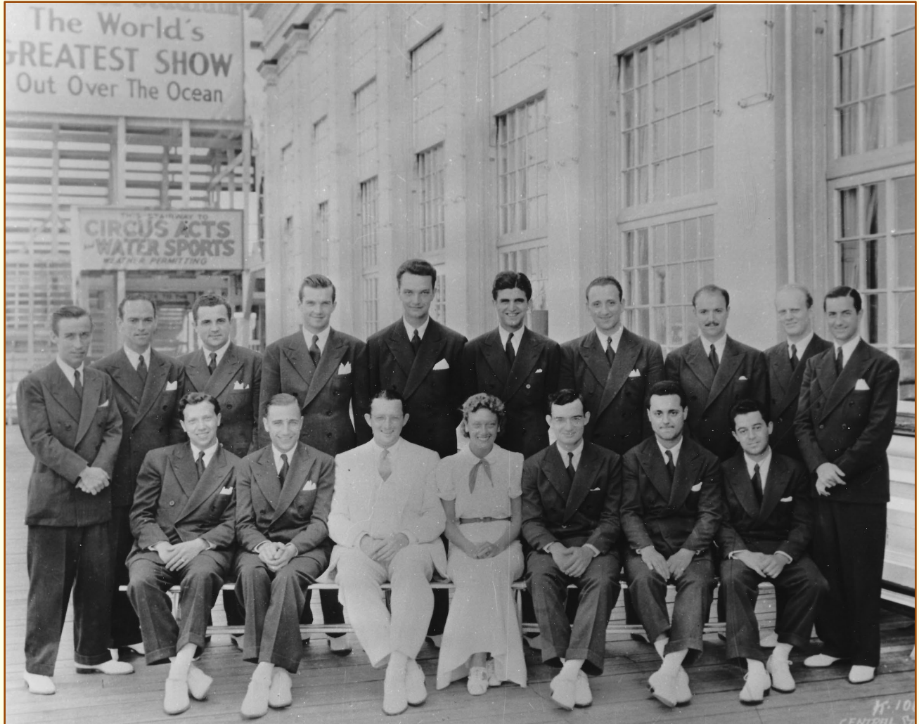
Tommy Dorsey and his Orchestra Steel Pier, Atlantic City, New Jersey July 1936