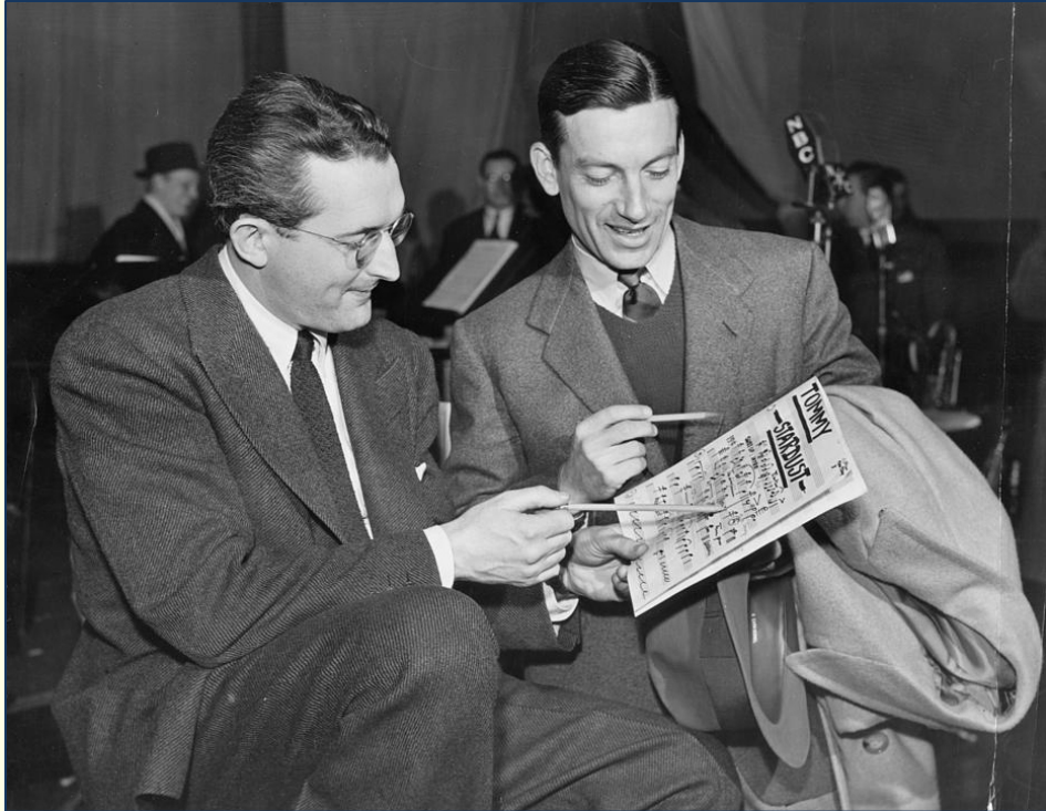
Tommy Dorsey and Hoagy Carmichael "Star Dust"