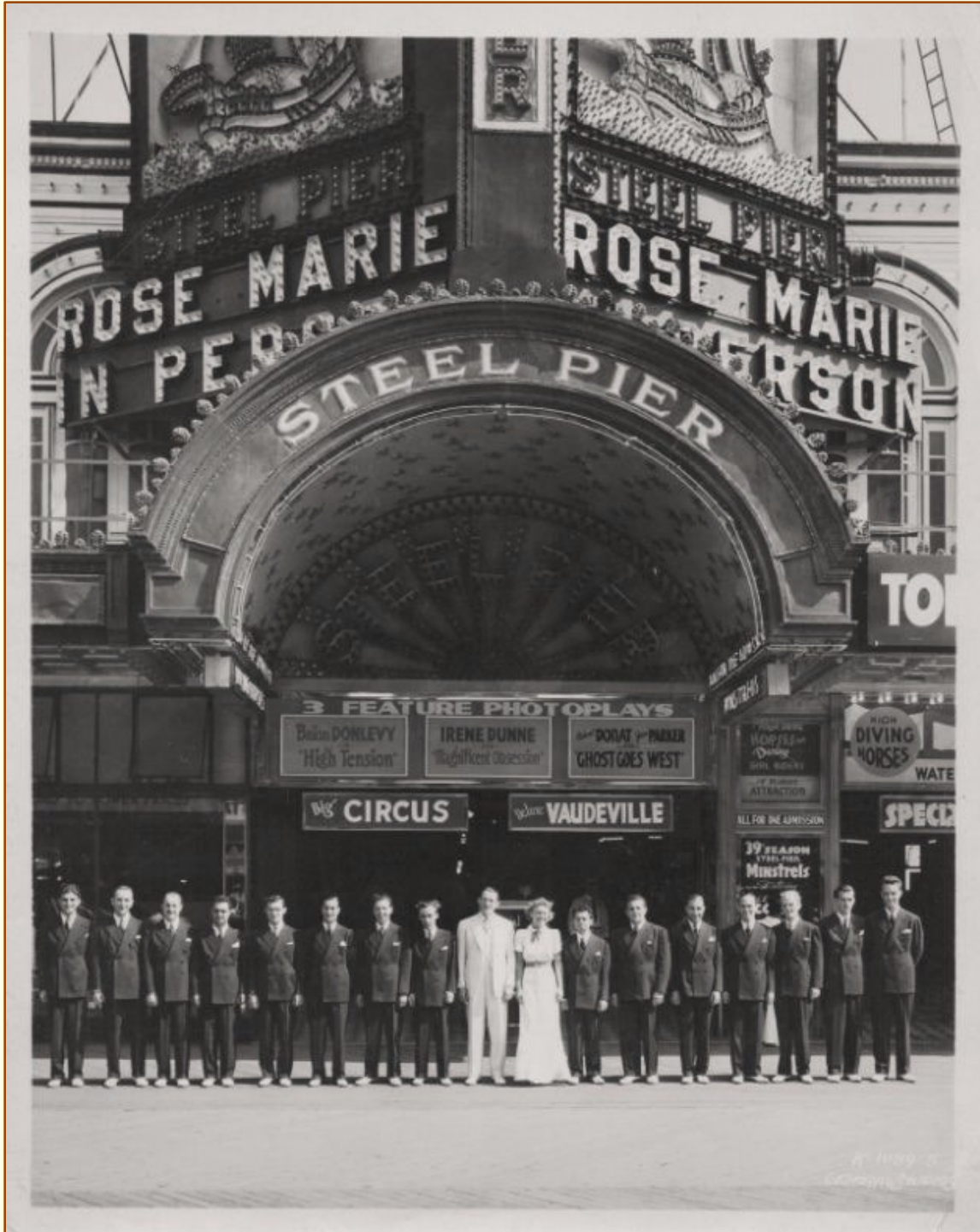
Tommy Dorsey and his Orchestra Steel Pier, Atlantic City, New Jersey July 1936