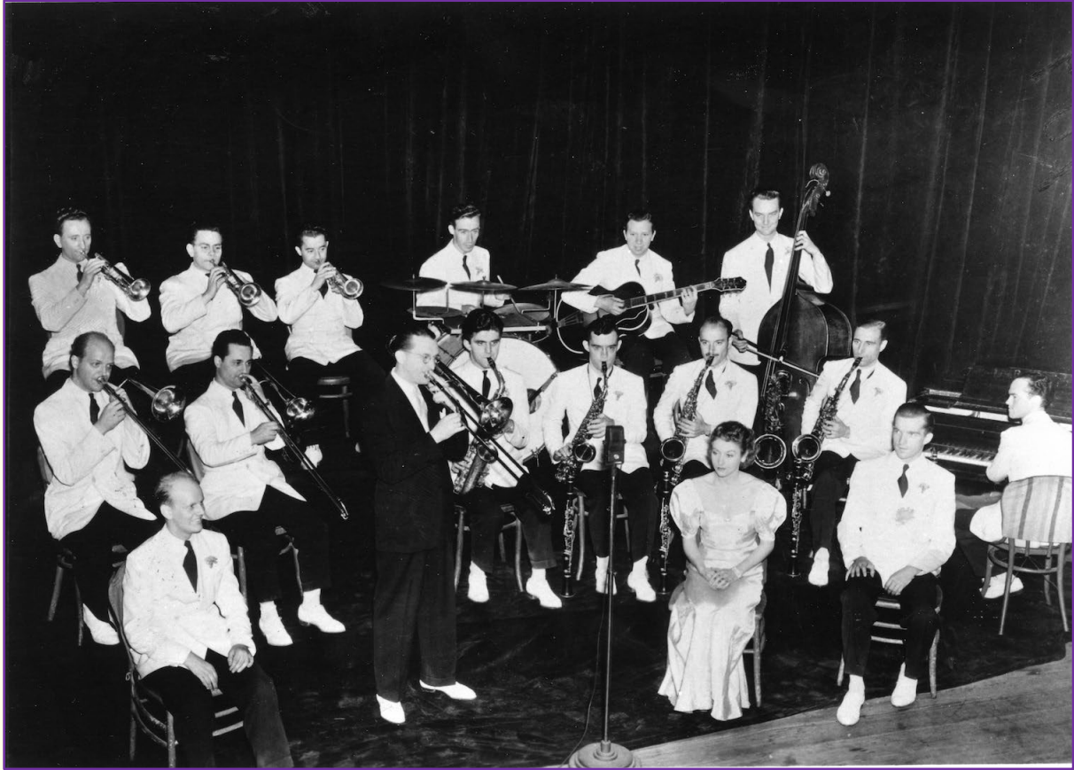
Tommy Dorsey and his Orchestra 1936