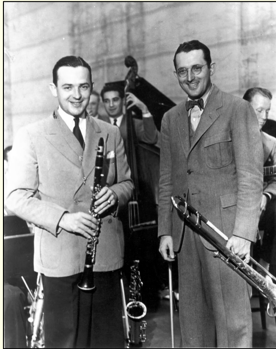
“The Brothers” Jimmy and Tommy Dorsey