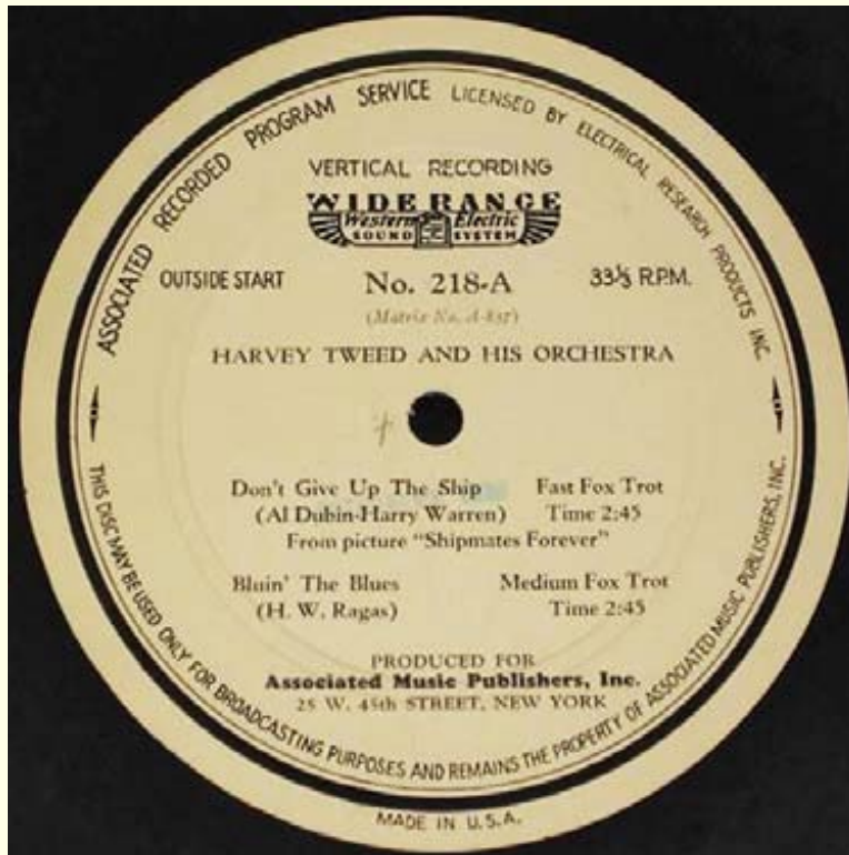
Electronic Transcription - November 14, 1935

Associated Recorded Program Service Transcription Recording Session November 14, 1935 (Thu) Electrical Research Products, Inc. Bronx, New York