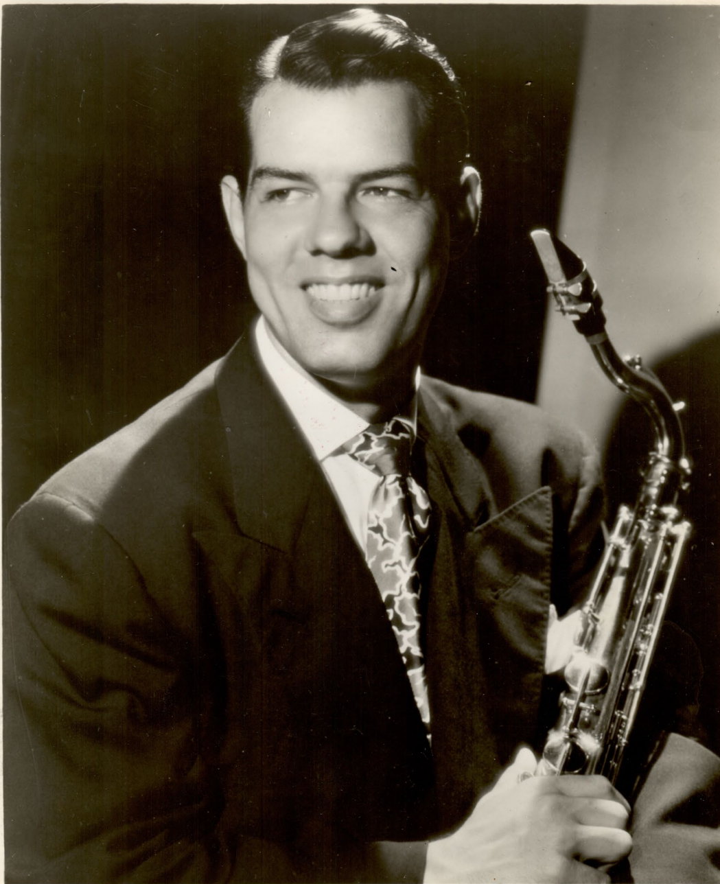
TEX BENEKE and the GLENN MILLER ORCHESTRA