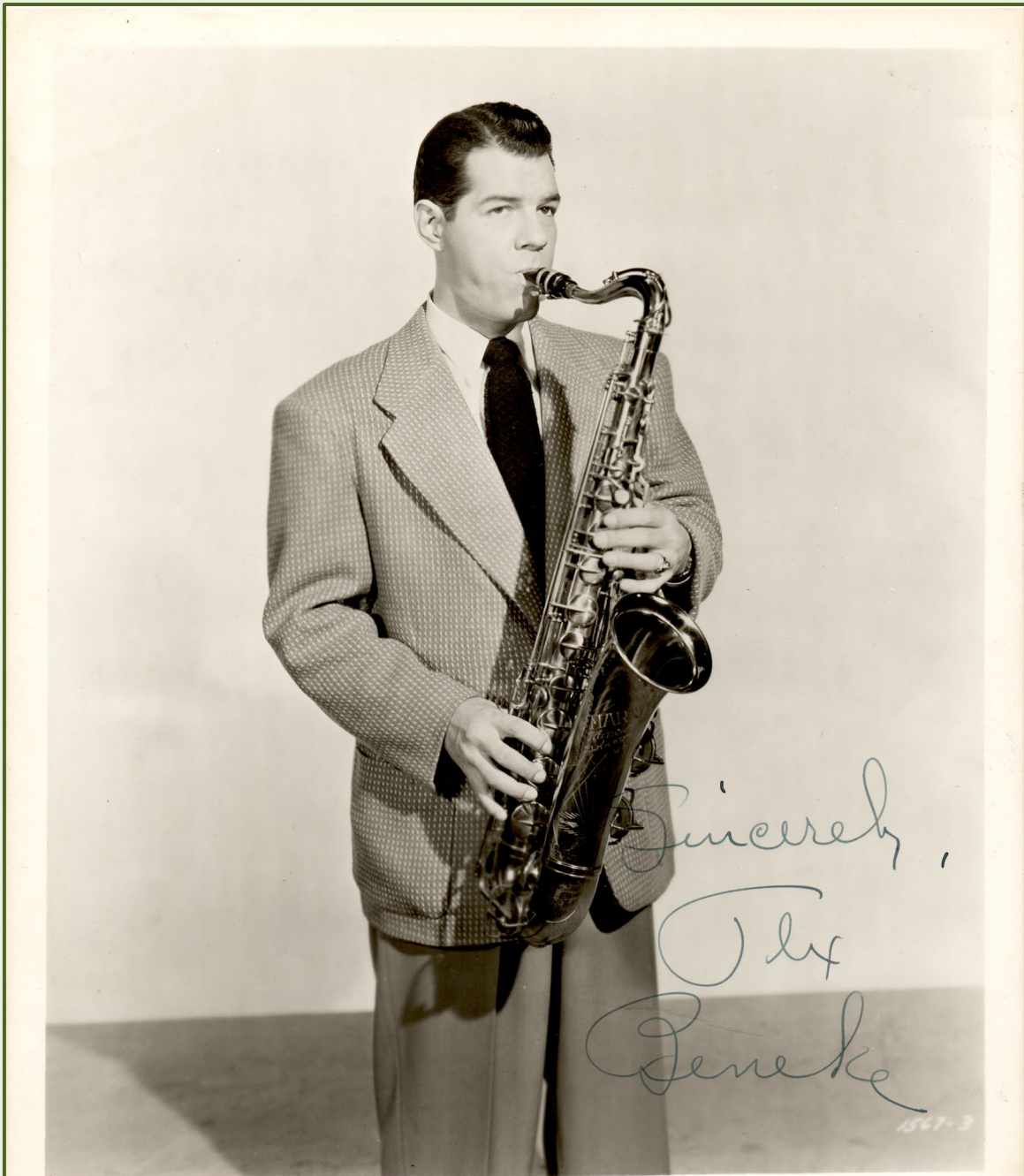
TEX BENEKE And His Orchestra