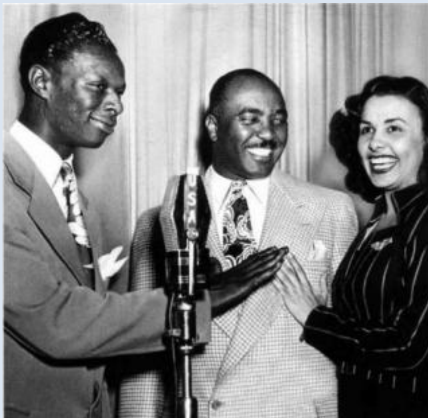
Nat "King" Cole, Jimmie Lunceford and Lena Horne