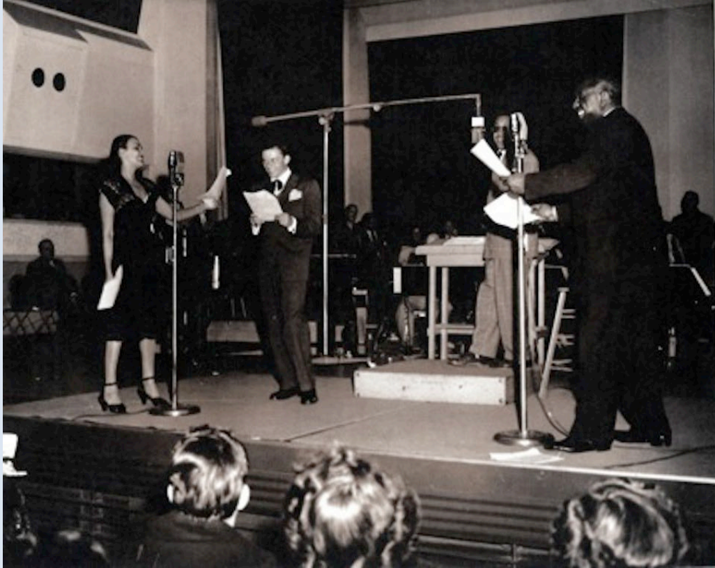
Lena Horne, Frank Sinatra and Ernie "Bubbles" Whitman Jubilee 172 (1945)

Ernest (or Ernie) "Bubbles" Whitman was an actor and entertainer who had appeared in many motion pictures. He portrayed the Pharaoh of Egypt in "Green Pastures" (1936) and Lt. Jim Europe of World War I fame in "Stormy Weather" (1943). Whitman cast a large shadow over "Jubilee," both physically and artistically. He had a great sense of self-deprecating humor and relished the role of master of ceremonies. Whitman understood the importance of "Jubilee" and made every effort to temper the comedy with the serious intent of promoting African American artists and serving the war effort. A physically large man, Whitman endured many jokes about his size and gave back better. He was "hep to the jive" as frequent "Jubilee" guest Cab Calloway might put it, and his announcements are peppered with jive talk. One of his most famous lines as "plant you now and dig you later" when closing the programs. Whitman's lines were both scripted by the SSD and AFRS staff but also widely ad-libbed, as were the other SSD and AFRS variety programs. Also, the host and entertainers could get away with a lot of dialogue which otherwise might not pass the censors at the domestic radio networks.