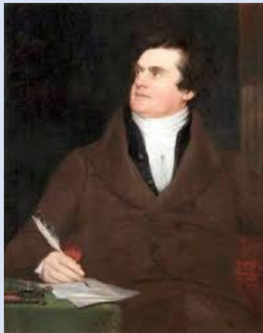
Gov. William Leete